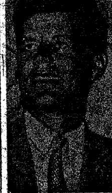
SEN. J. F. KENNEDY Home From Europe By Air

PRESTWICK, Scotland (AP)—A 10-foot barbed-wire fence has been put up around a U. S. Air Force camp here to keep the men in, but reportedly to keep the girls out.