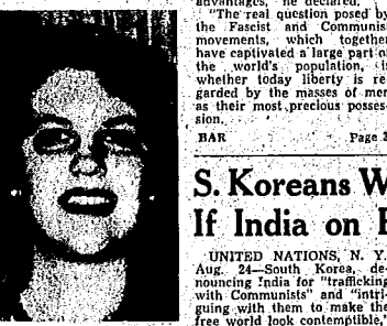
SYLVIA PLATH, missing Wellesley girl.