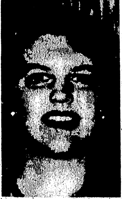
SYLVIA PLATH, missing Wellesley girl.