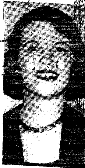
Associated Press photograph of Miss Sylvia Plath.

ALBANY, Aug. 26.—Hendrickson Bus Corp. was authorized today by the Public Service Commission to abandon a portion of its Oyster Bay-Farmingdale route, which extends 5.1 miles from the Republic Aviation Corp. plant in Conklin St. in the Town of Babylon via Conklin St., Conklin Ave., Fulton St., Hemstead Turnpike, Ste-